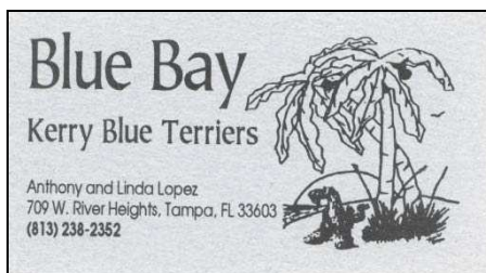
Paid Advertisement Dec 2006