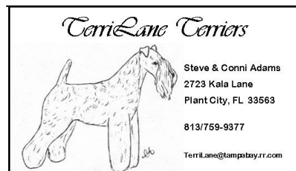
Paid Advertisement Dec. 2007