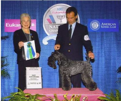
Keri-Star Dixie Darling AKC/Eukanuba Invitational AOM