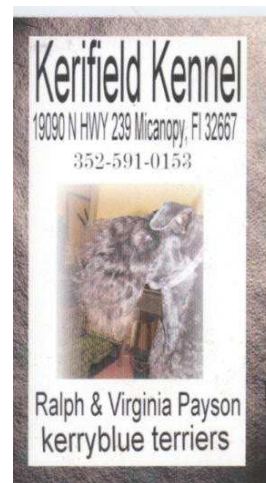
Paid Advertisement Dec 2007