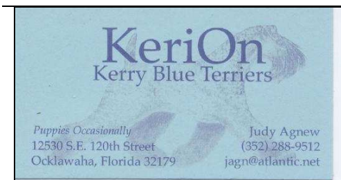
Paid Advertisement Dec 2007