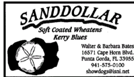
Paid Advertisement Dec. 2007